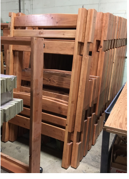
Beds waiting for transportation and assembly.

PREGNANT AND PARENTING WOMEN'S PROGRAM BENEFITS FROM ROTARIAN AND HP VOLUNTEERS